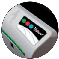
Warning lights for a quick diagnosis of the dryer.