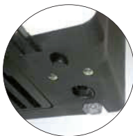
Water tank easily removable from the external side.