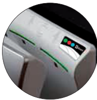
4 air diffusion layers for an ultra-fast drying.